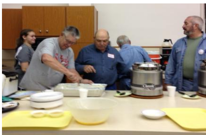
More mashed potatoes!

A big Thank You to all who worked at the Community Meal in October. We served 100 people which is the largest number since we started the meals. The next Community Meal is scheduled for Thursday, December 17th. If you are planning on helping at the meal, please include your name on the sign-up sheet on the counter in Benedict Hall.